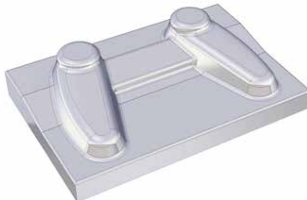
Finish profiling for general mold and die applications