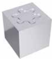
Direct milling on small sized high-hardened steel material